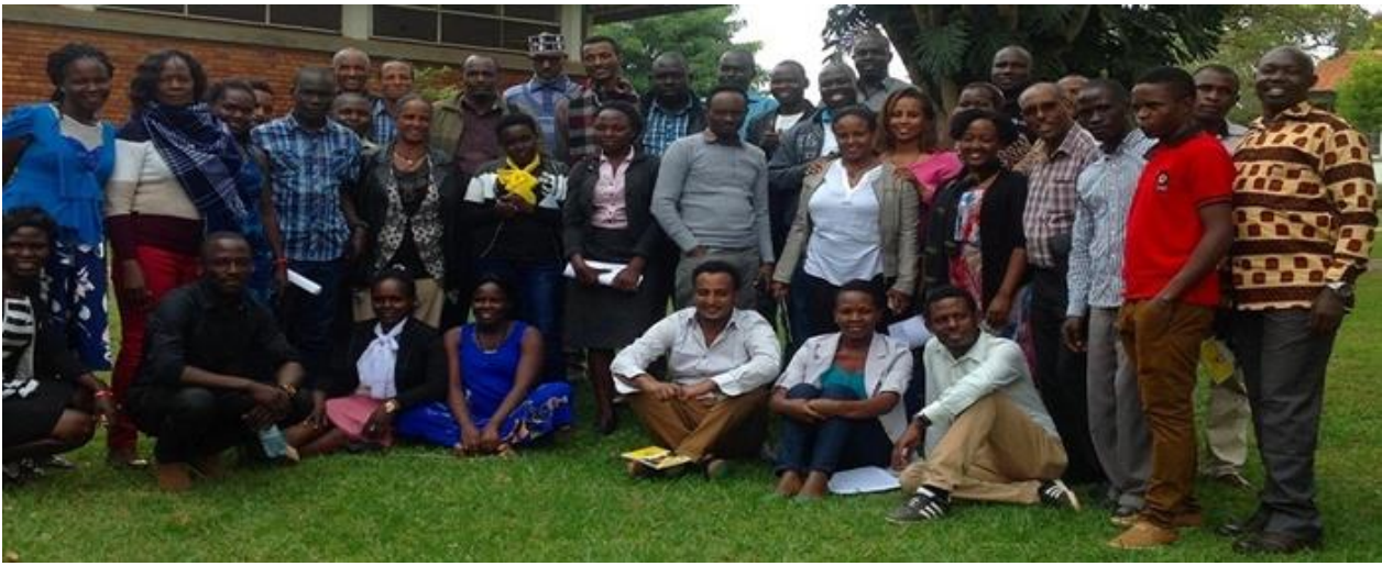
Group photo UMU 2018