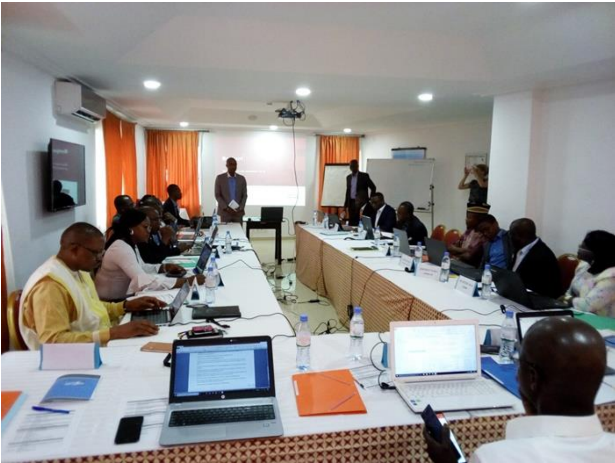
Participants picture during session