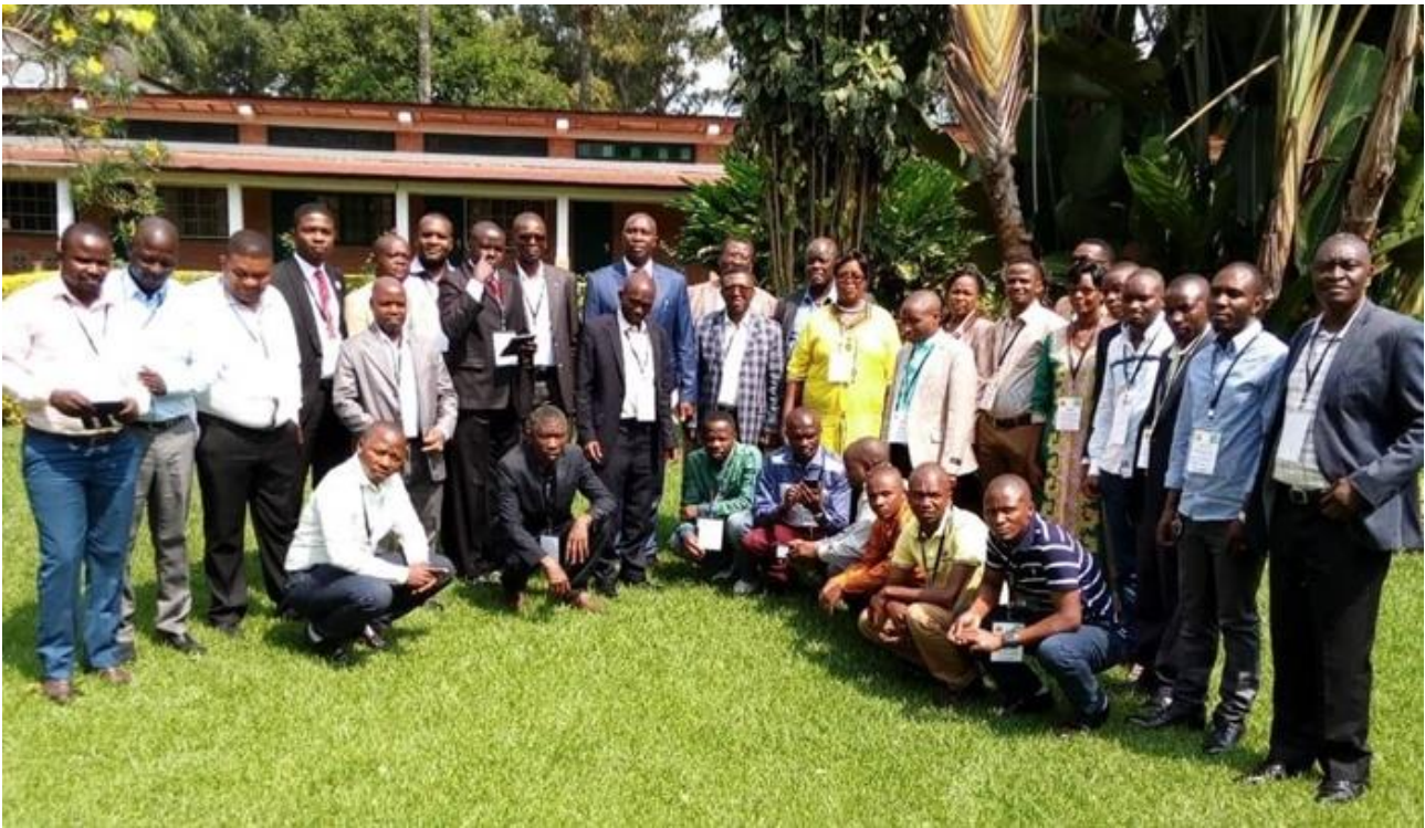
Group photo Bukavu 2018