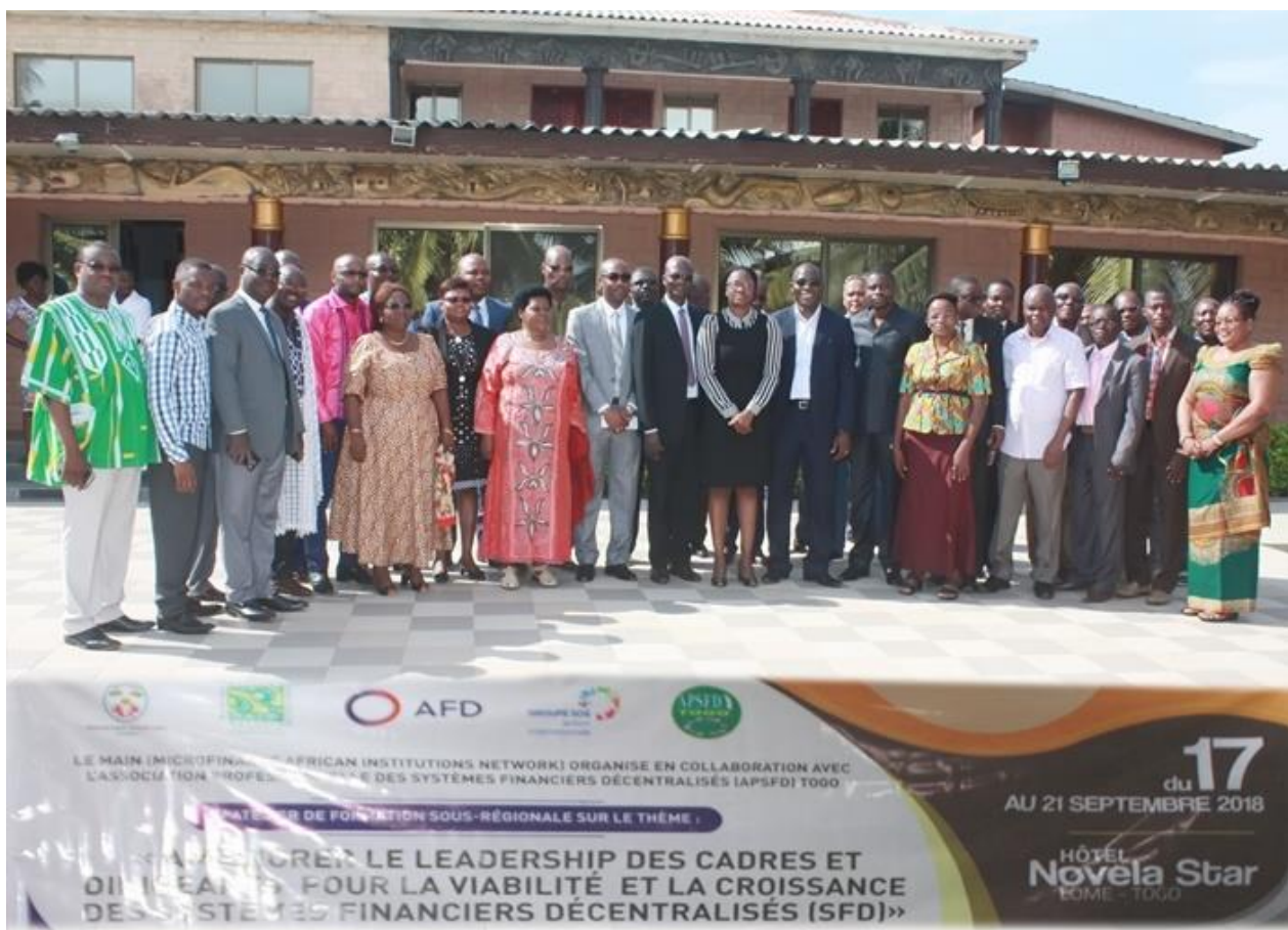
Group photo leadership workshop 2018

Finally, the Secretary of State also stressed the importance for managers to "acquire a new way of thinking and working with others" .