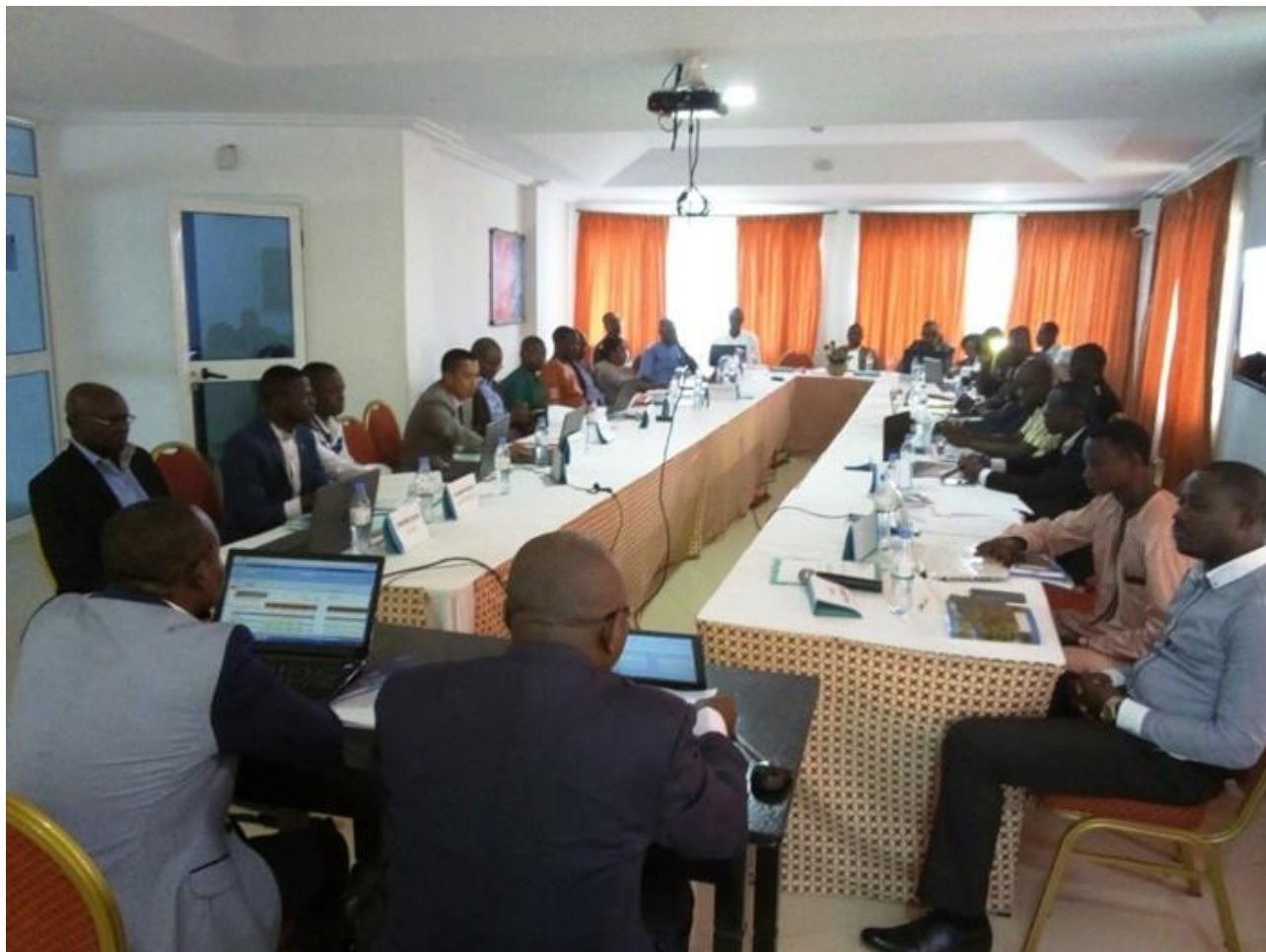
Participants photo during plenary

The training was conducted by a certified consultant, Ignace DOVI. The training was very practical, dynamic and participatory. The analysis of the evaluation forms shows a very good level of satisfaction of the participants. The closing ceremony and handover the certificates were made by the Executive Director of MAIN who encouraged participants to share the learning outcomes with their colleagues.