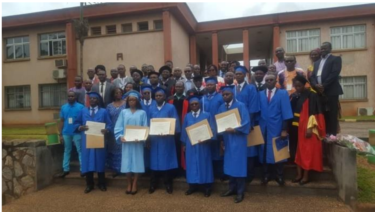
Photo of the graduation ceremony UCAC 2018